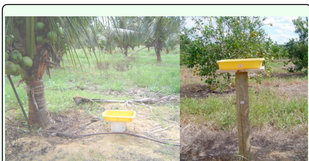
Figure 1. Yellow pan traps installed in the culture of Cocos nucifera on a plastic tube at a height of 0.2 meters above ground level (at left) and in the culture of Citrus spp. placed on wooden stakes at a height of 1.20 meters above ground level (at right). High quality figures are available online.

In each area cultivated with P. guajava , C. papaya , and Citrus spp., 10 traps were installed. These traps were placed on wooden stakes at a height of 1.2 m above ground level (Figure 1), spaced 25 meters from one another alternately in three rows. The collection and exchange of the trap solution was made weekly during 54 weeks, from June 2010 to July 2011.