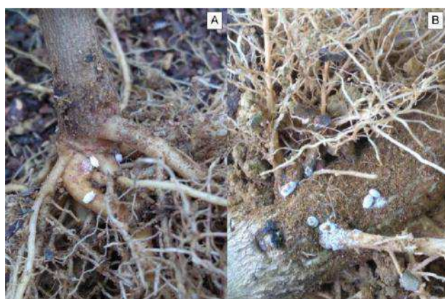
Fig. 3. Root system of Bidens pilosa L. (A) and Ageratum conyzoides L. (B) attacked by Planococcus spp. collected in the studied conilon coffee cultivation areas, Marilândia and Linhares, ES, Brazil.

The occurrence of mealybug in weeds was observed mainly in the root system of host plants, close to the basal region, such as B. pilosa and A. conyzoides (Figures 3A and 3B), both in the young phase (nymphs), and in the adult phase of P. citri and P. minor . Similarly, Fornazier [15] observed the presence of P. citri in the region of the roots of the species B. pilosa , Lepidium virginicum L. and Cucurbita maxima Duchesne.